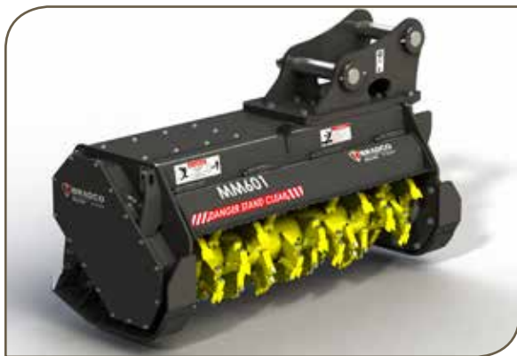
Shown with optional mount