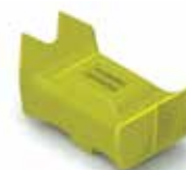
Reversible Claw Tooth