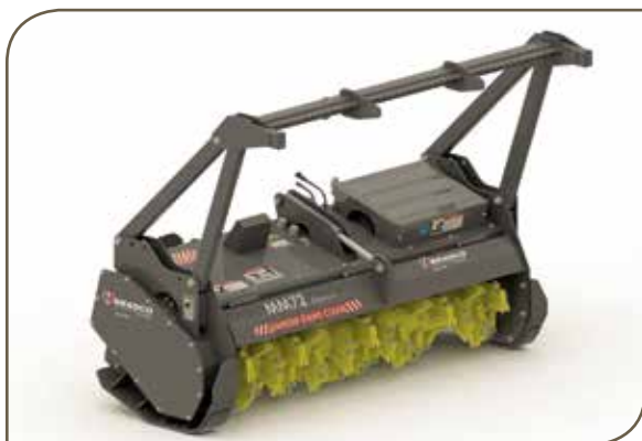
Shown with optional oil cooler

On-board pressure gauge easily viewed from operators station to monitor system pressure (N/S for excavator only models)