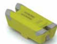
Reversible Carbide Tooth